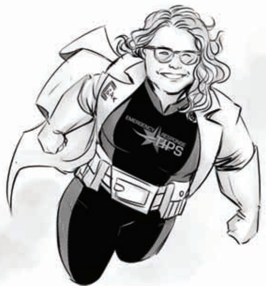
Images are courtesy of Phil Buckenham https://philbuckenhamart.wixsite.com/philbuckenham

More information on our range of events via www.cbrneworld.com